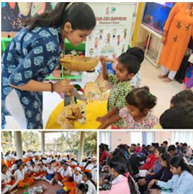
Fig 1.1 Environmental education at the primary, secondary and tertiary levels of education system in India.