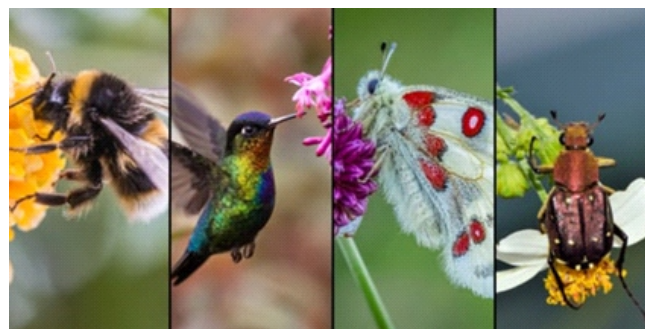
Fig 2: Honeybee, Humming bird, butterfly and beetle.